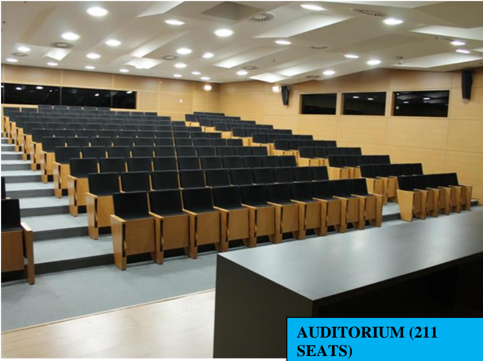
AUDITORIUM (211 SEATS)