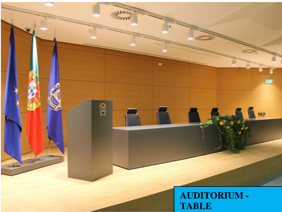
AUDITORIUM - TABLE