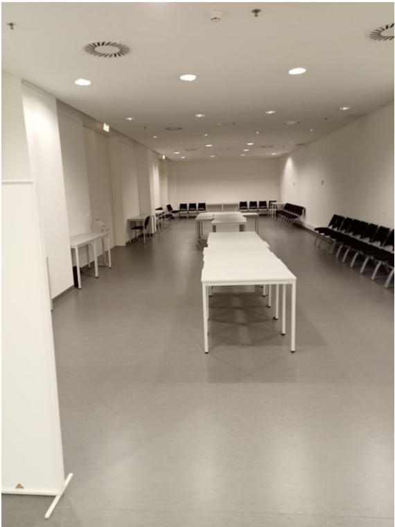
EXHIBITIONS ROOM AND COFFEE BREAKS